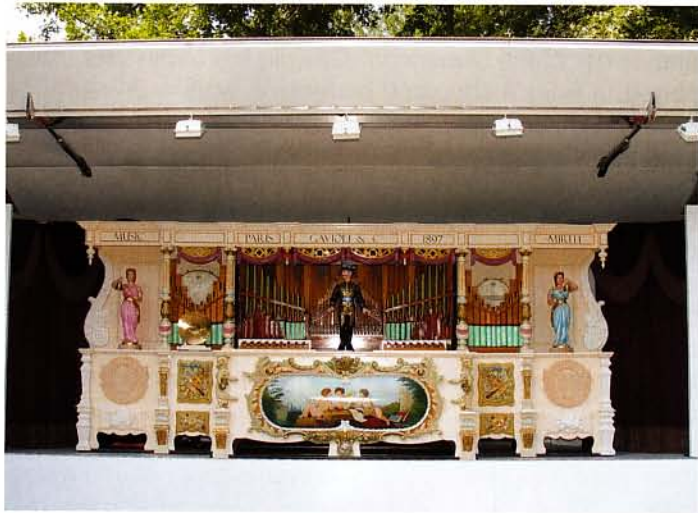
The Diamond Jubilee organ open and ready for business in the new display trailer. Signage on the trailer is in the works.