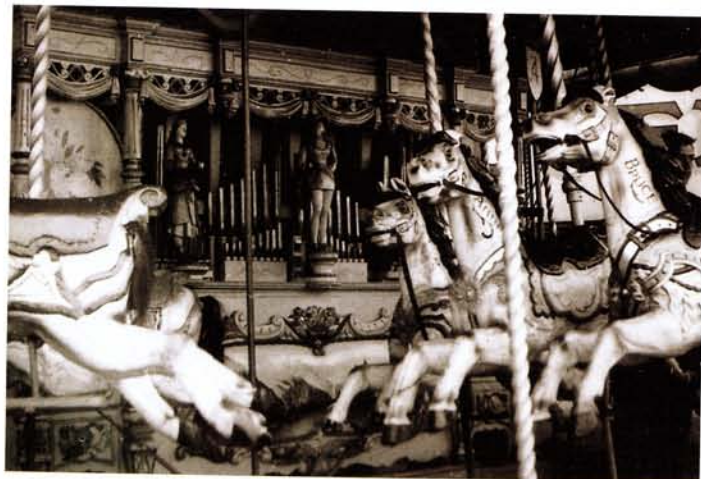
The Gavioli prior to conversion to 89 keys in the 3-abreast gallopers at Wonderland Amusement Park, Cleethorpes.