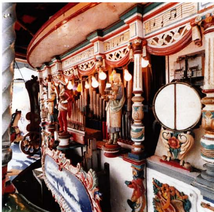
The Gavioli mounted in a smaller galloper post-conversion to the 89 VB scale, probably in the 1960s. The violin pipes are removed from the organ in this photo.

The Jubilee currently plays only traditional cardboard