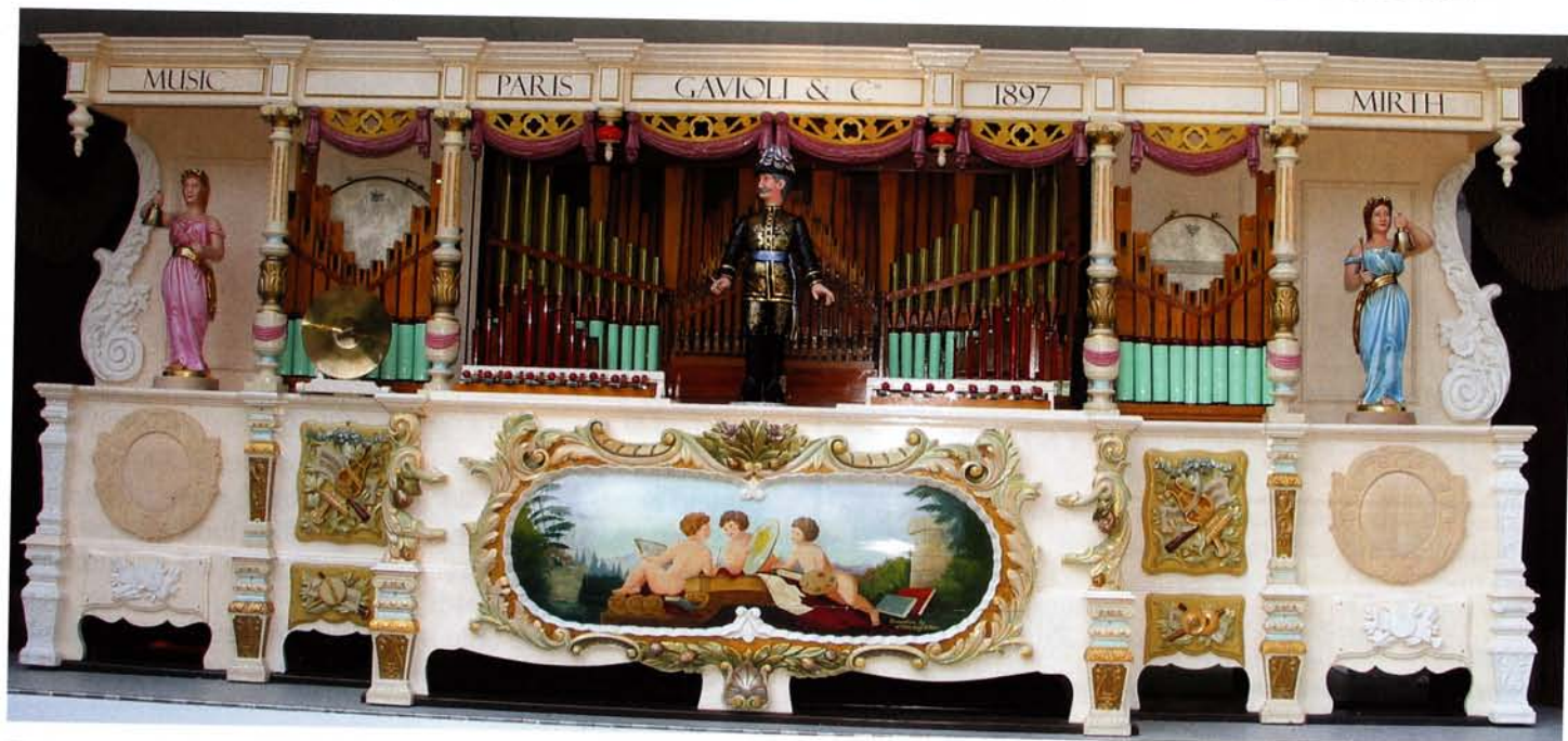
The Diamond Jubilee today. Painting will be completed this winter and a new proscenium added in the coming year.