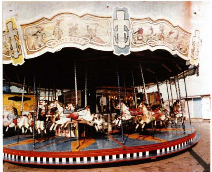
The gallopers at Wonderland, Cleethorpes, with the Gavioli mounted in the center. Photo is probably from the 1960s.

done, the carvings were repainted by the well-known fair-ground artist, James Tiller, but the project stalled. The carvings and organ parts were stored safely, but the case, with the main bellows, was allowed to sit out in the weather and were gradually destroyed.